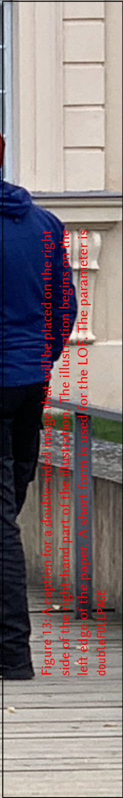
Figure 13: A caption for a double-sided image that will be placed on the right side of the right-hand part of the illustration. The illustration begins on the left edge of the paper. A short form is used for the LOF. The parameter is doubleFULLPAGE