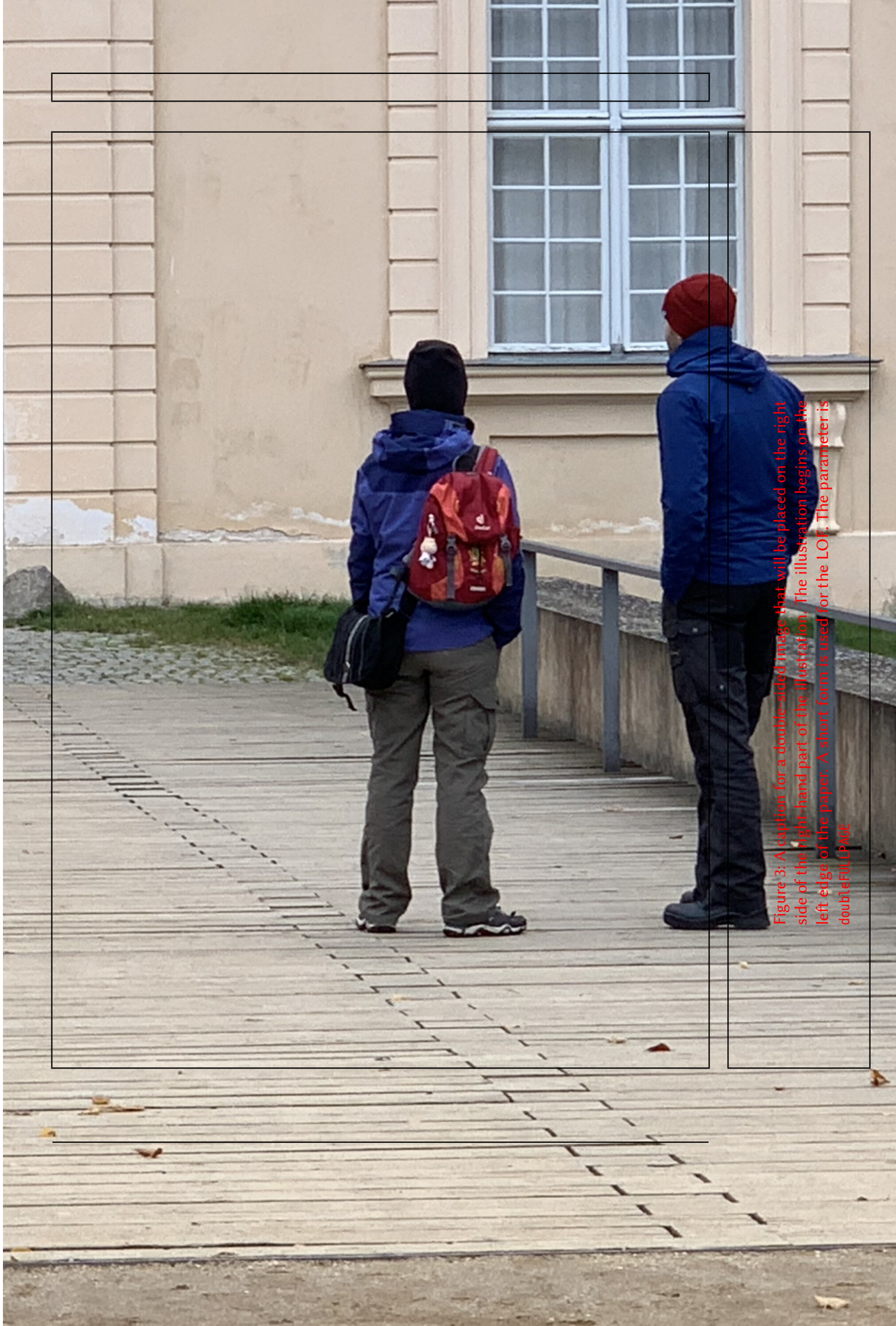
Figure 3: A caption for a double-sided image that will be placed on the right side of the right-hand part of the illustration. The illustration begins on the left edge of the paper. A short form is used for the LOE. The parameter is doubleFULLPAGE