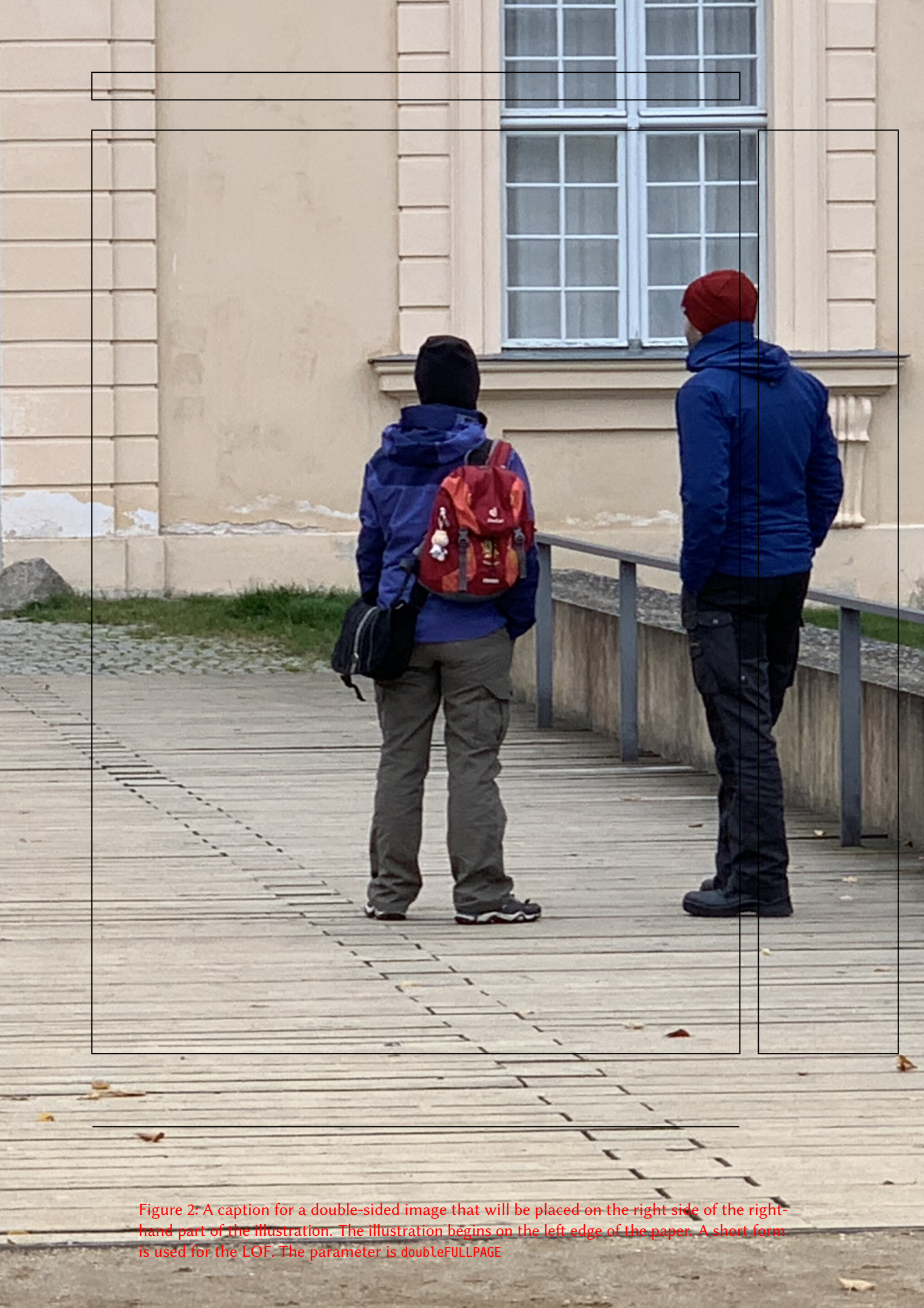
Figure 2: A caption for a double-sided image that will be placed on the right side of the right-hand part of the illustration. The illustration begins on the left edge of the paper. A short form is used for the LOF. The parameter is doubleFULLPAGE