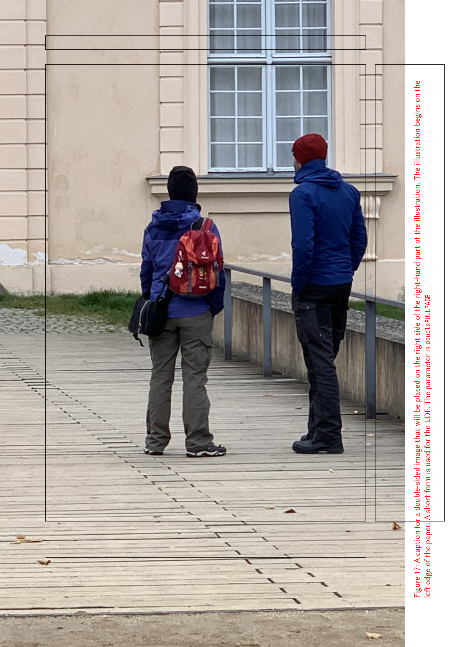
Figure 17: A caption for a double-sided image that will be placed on the right side of the illustration. The illustration begins on the left edge of the paper. A short form is used for the LOF. The parameter is doubleFULLPAGE