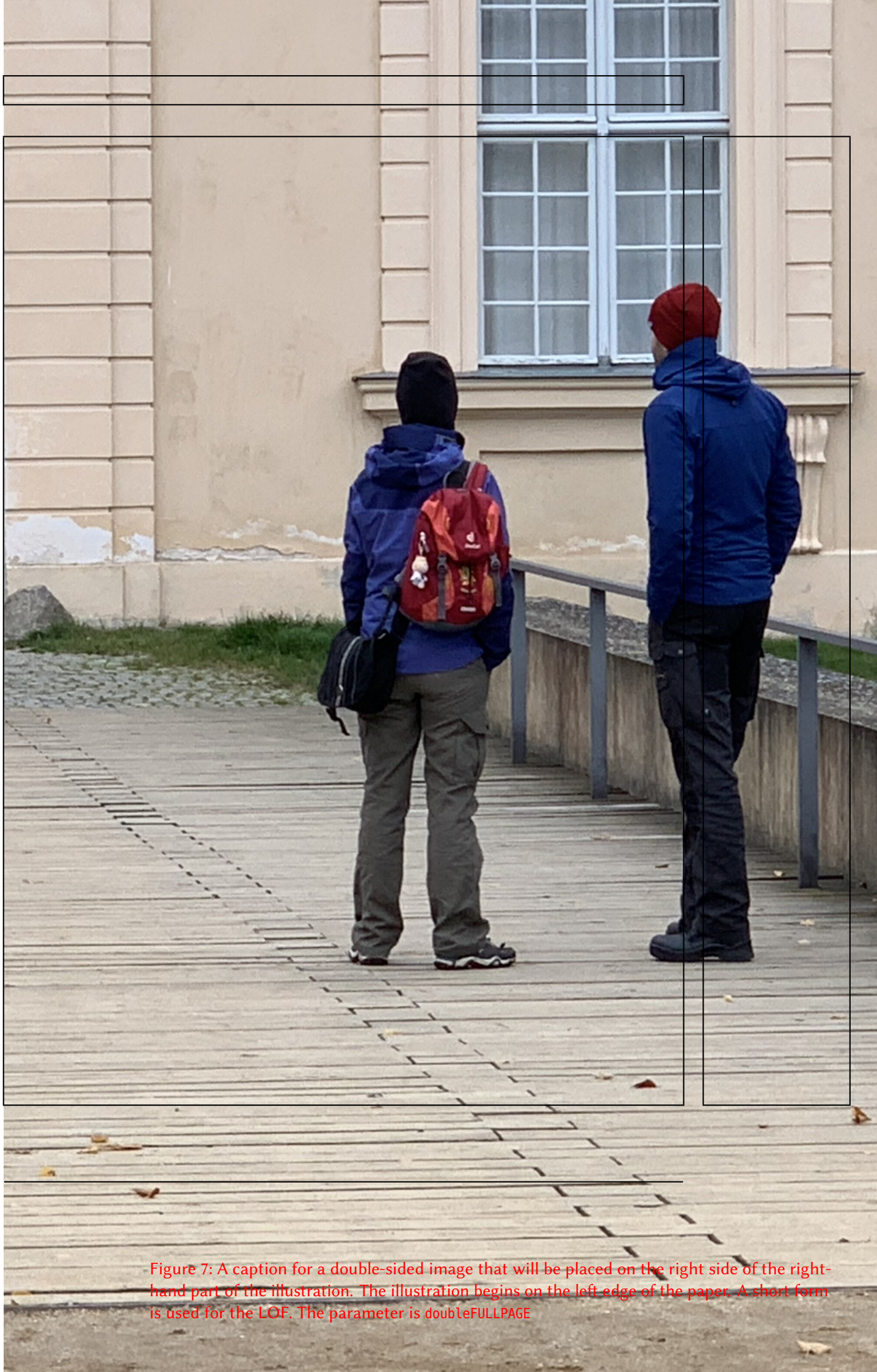
Figure 7: A caption for a double-sided image that will be placed on the right side of the right-hand part of the illustration. The illustration begins on the left edge of the paper. A short form is used for the LOF. The parameter is doubleFULLPAGE