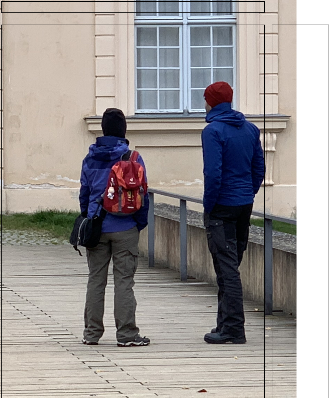
Figure 10: A caption for a double-sided image that will be placed on the right side of the right-hand part of the illustration. The illustration begins on the left edge of the paper. A short form is used for the LOF. The parameter is doubleFULLPAGE