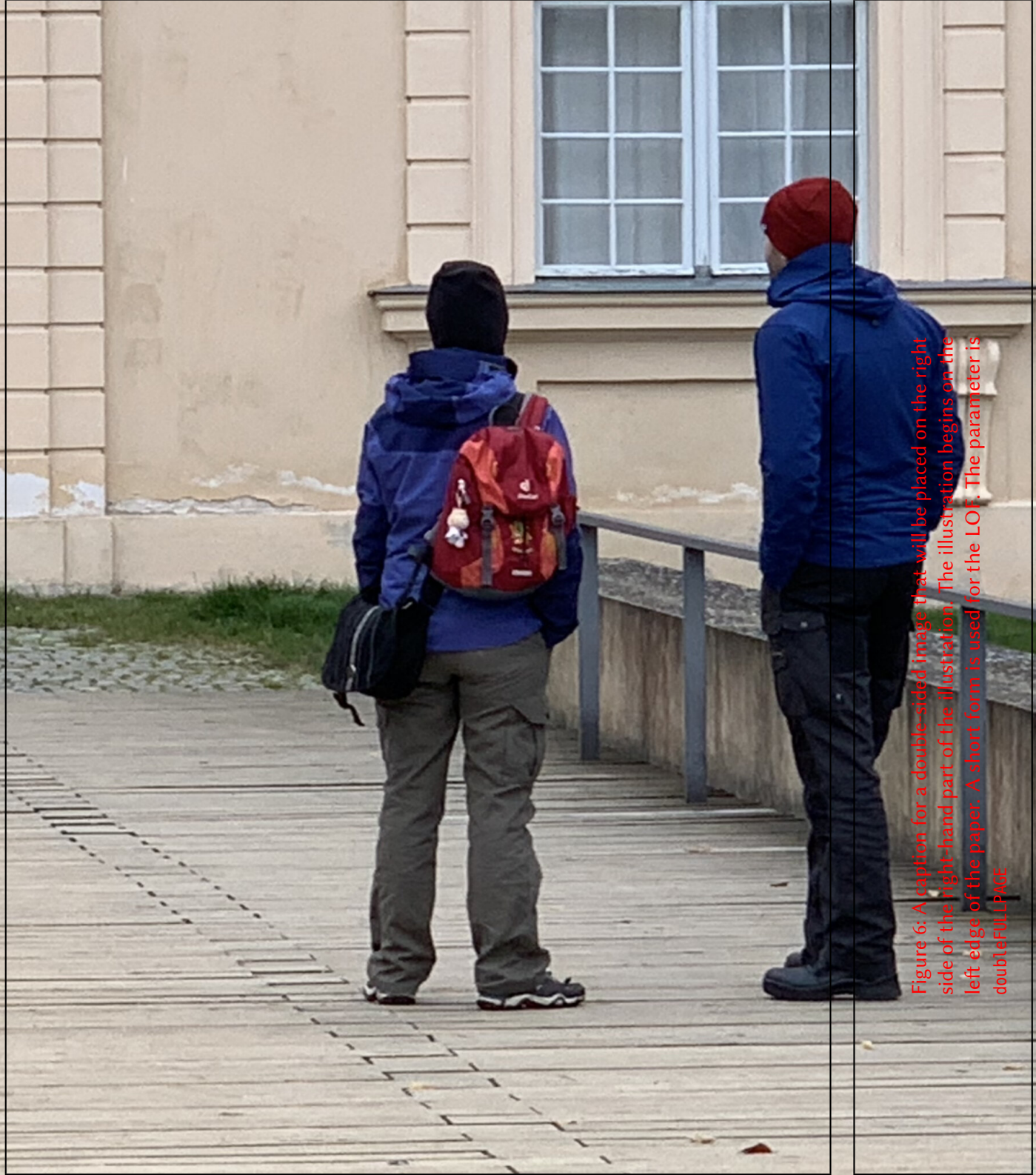
Figure 6: A caption for a double-sided image that will be placed on the right side of the right-hand part of the illustration. The illustration begins on the left edge of the paper. A short form is used for the LOI. The parameter is doubleFULLPAGE