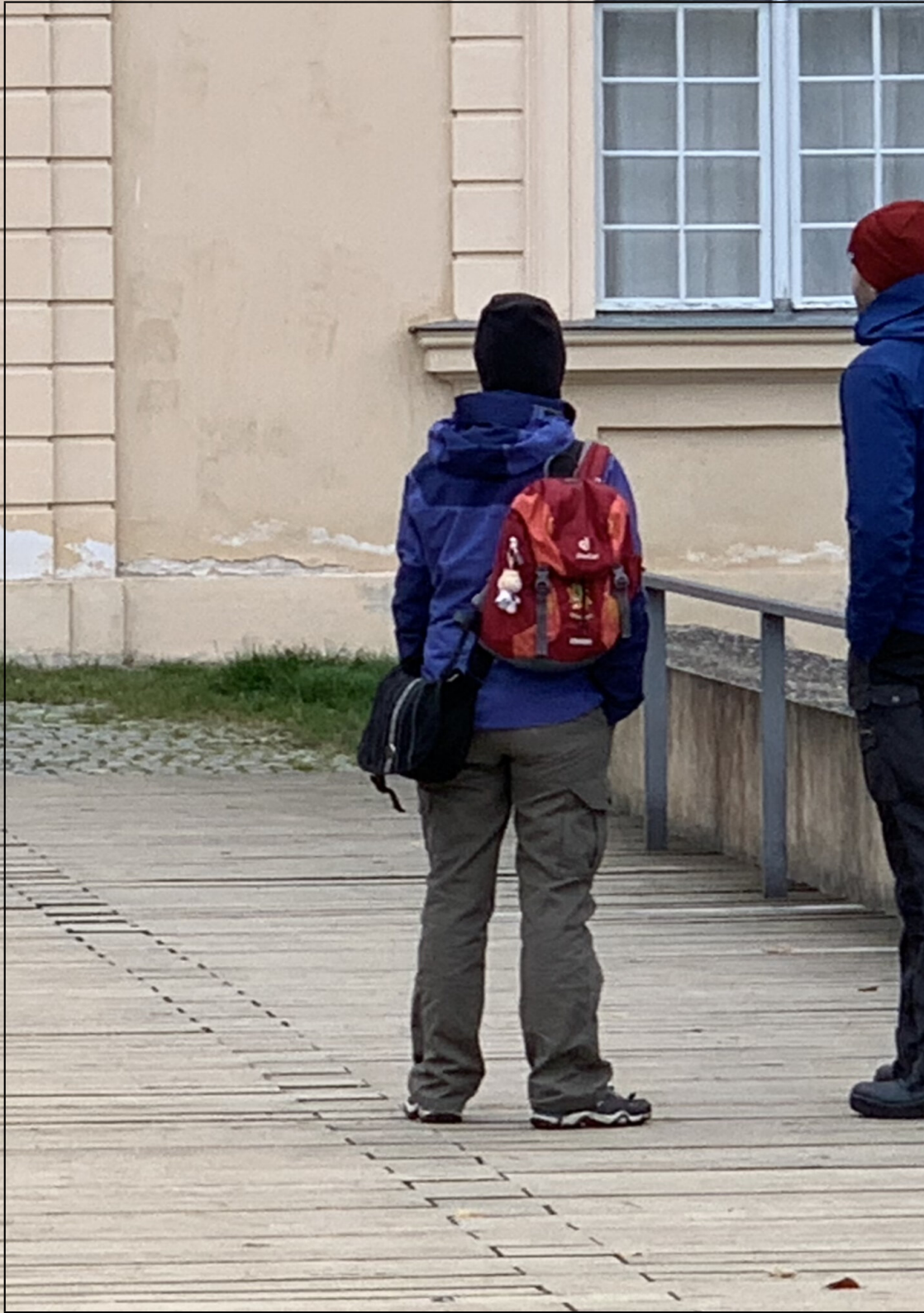
Figure 5: A caption for a double-sided image that will be placed on the right side of the right-hand part of the illustration. The illustration begins on the left edge of the paper. A short form is used for the LOI. The parameter is doubleFULLPAGE