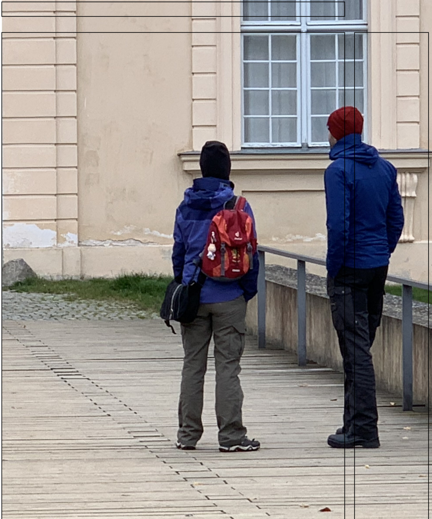
Figure 15: A caption for a double-sided image that will be placed on the right side of the right hand part of the illustration. The illustration begins on the left edge of the paper. A short form is used for the LOF. The parameter is doubleFULLPAGE